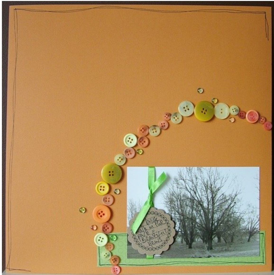
Designed by Deanne Evans http://deezkatz.blogspot.com for http://easycraftprojects.net © August 2009